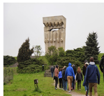
Holocaust Study Tour 2014

a world renowned Holocaust Education Program that allows for the student to immerse in the history that resonates with advocacy and activism in current times. I am impressed by the willingness of our students to take part and