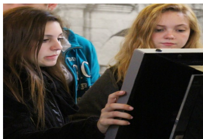
Jewish Museum, Berlin Holocaust Study Tour 2014

take action to make Midland Park a place of acceptance-a place of respect.