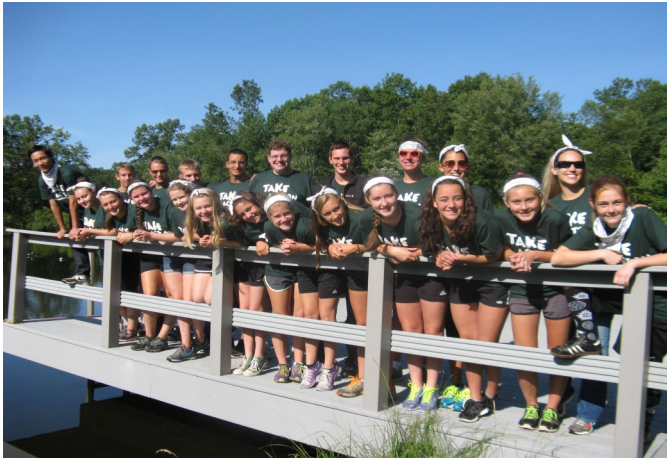
Midland Park Take Action Peer Leaders